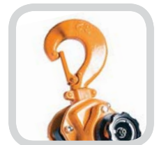
Tip load hook